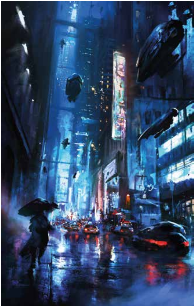
21 | Me and my Umbrella , 2014 | Adobe Photoshop, giclée print, 72x100 | signed I. D.: D. Zabrocki at lower right, endorsed on the reverse, limited edition of 20 22 | Walking on the street , 2014 | Adobe Photoshop, giclée print, 100x63 | signed I. D.: D. Zabrocki at lower right, endorsed on the reverse, limited edition of 20