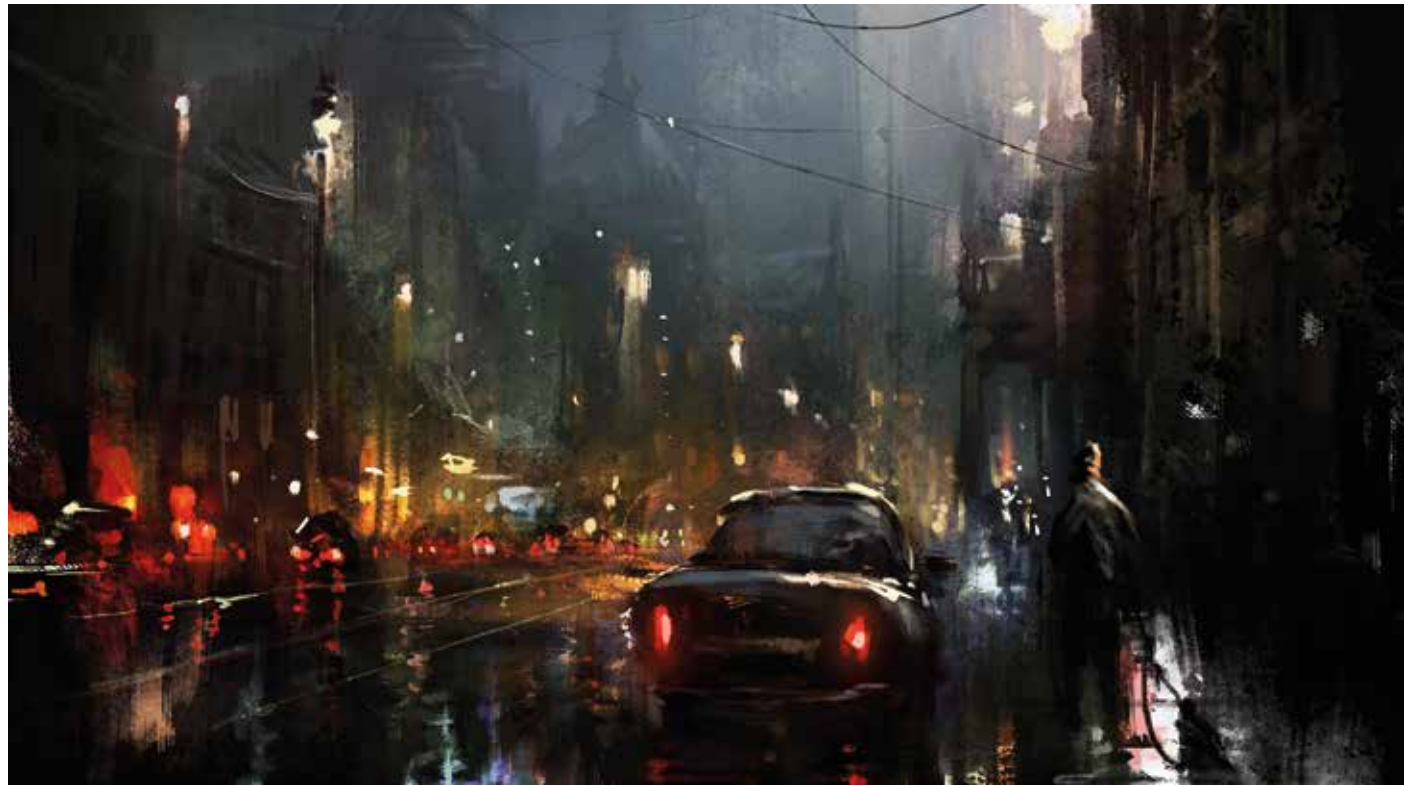
17 | Night London, 2014 | Adobe Photoshop, giclée print, 120x67 | signed I. D.: D. Zabrocki at lower right, endorsed on the reverse, limited edition of 20