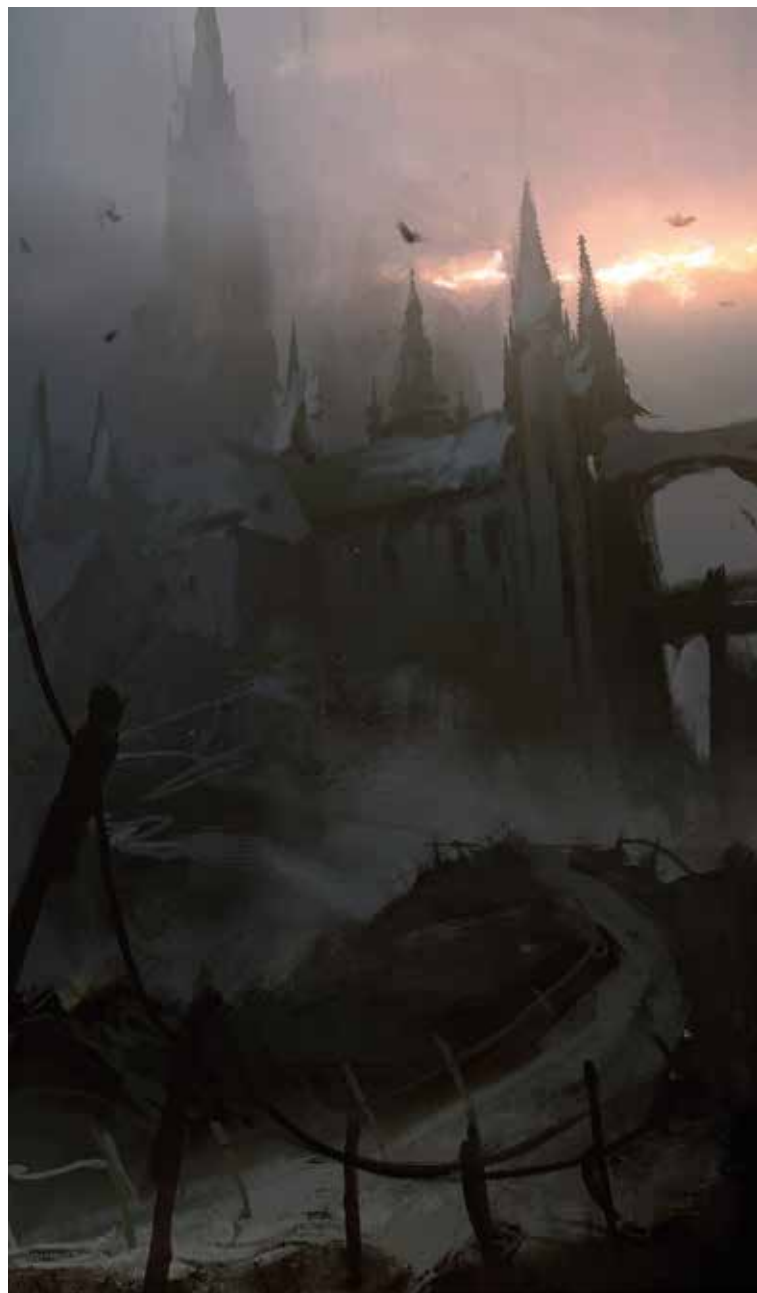
7 | Castle in the fog , 2015 | Adobe Photoshop, giclée print, 35x60 | signed I. D.: D. Zabrocki at lower right, endorsed on the reverse, limited edition of 20