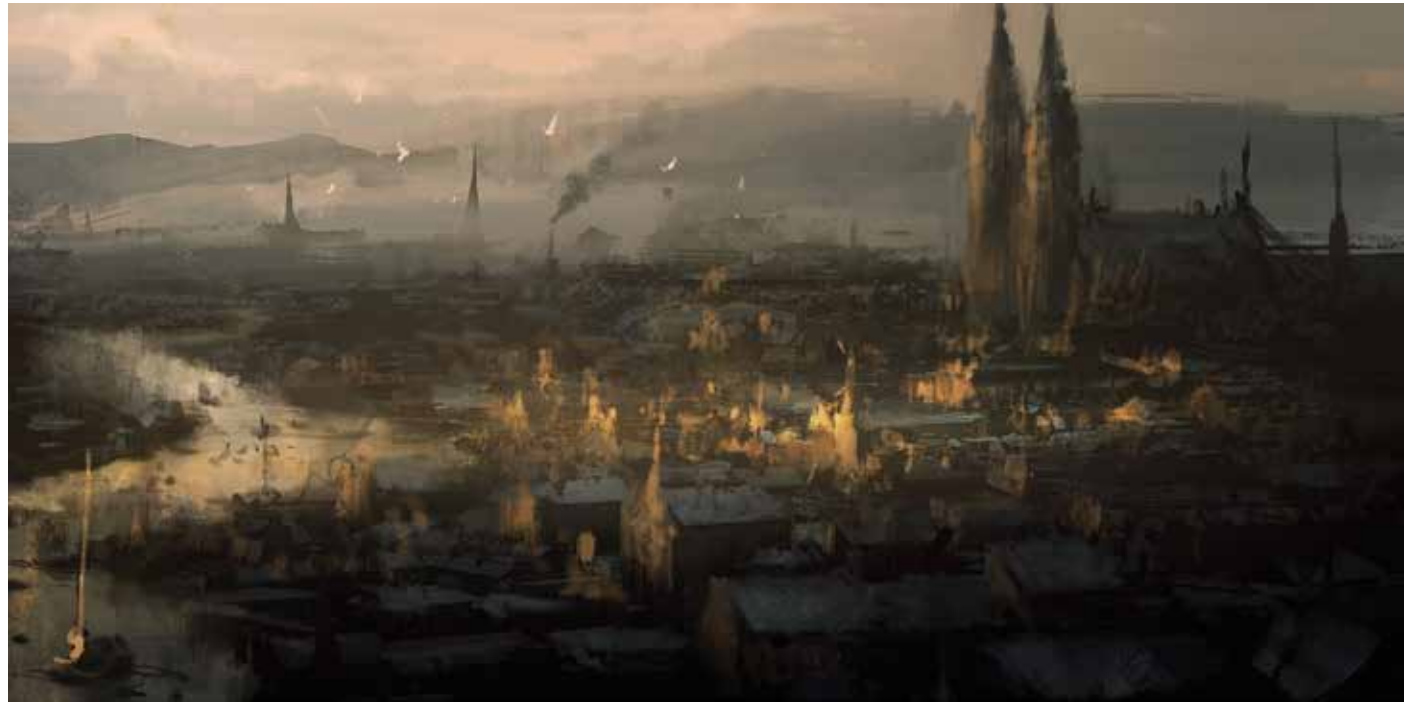
13 | River View , 2015 | Adobe Photoshop, giclée print, 100x52 | signed I. D.: D. Zabrocki at lower right, endorsed on the reverse, limited edition of 20