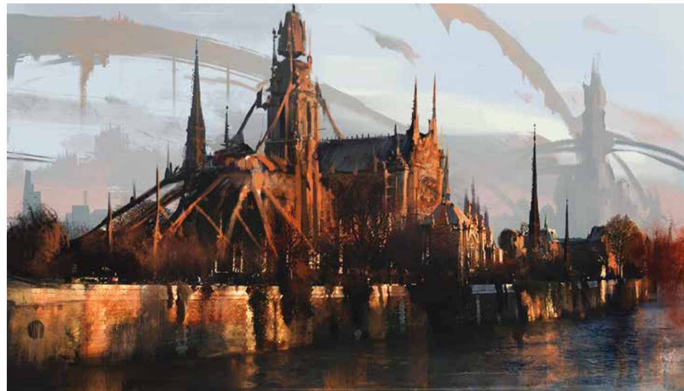
6 | Exploration Enviro , 2014 | Adobe Photoshop, giclée print, 70x41 | signed I. D.: D. Zabrocki at lower right, endorsed on the reverse, limited edition of 20