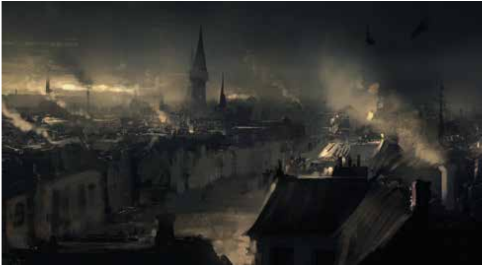
23 | Riot sketch1 , 2014 | Adobe Photoshop, giclée print, 40x26 | signed I. D.: D. Zabrocki at lower right, endorsed on the reverse, limited edition of 20