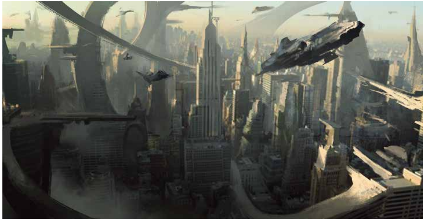
10 | Metropolis , 2014 | Adobe Photoshop, giclée print, 100x50 | signed I. D.: D. Zabrocki at lower right, endorsed on the reverse, limited edition of 20