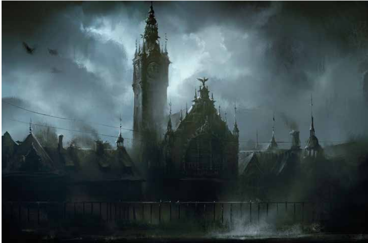
12 | Gdańsk Central Station , 2014 | Adobe Photoshop, giclée print, 100x66 | signed I. D.: D. Zabrocki at lower right, endorsed on the reverse, limited edition of 20