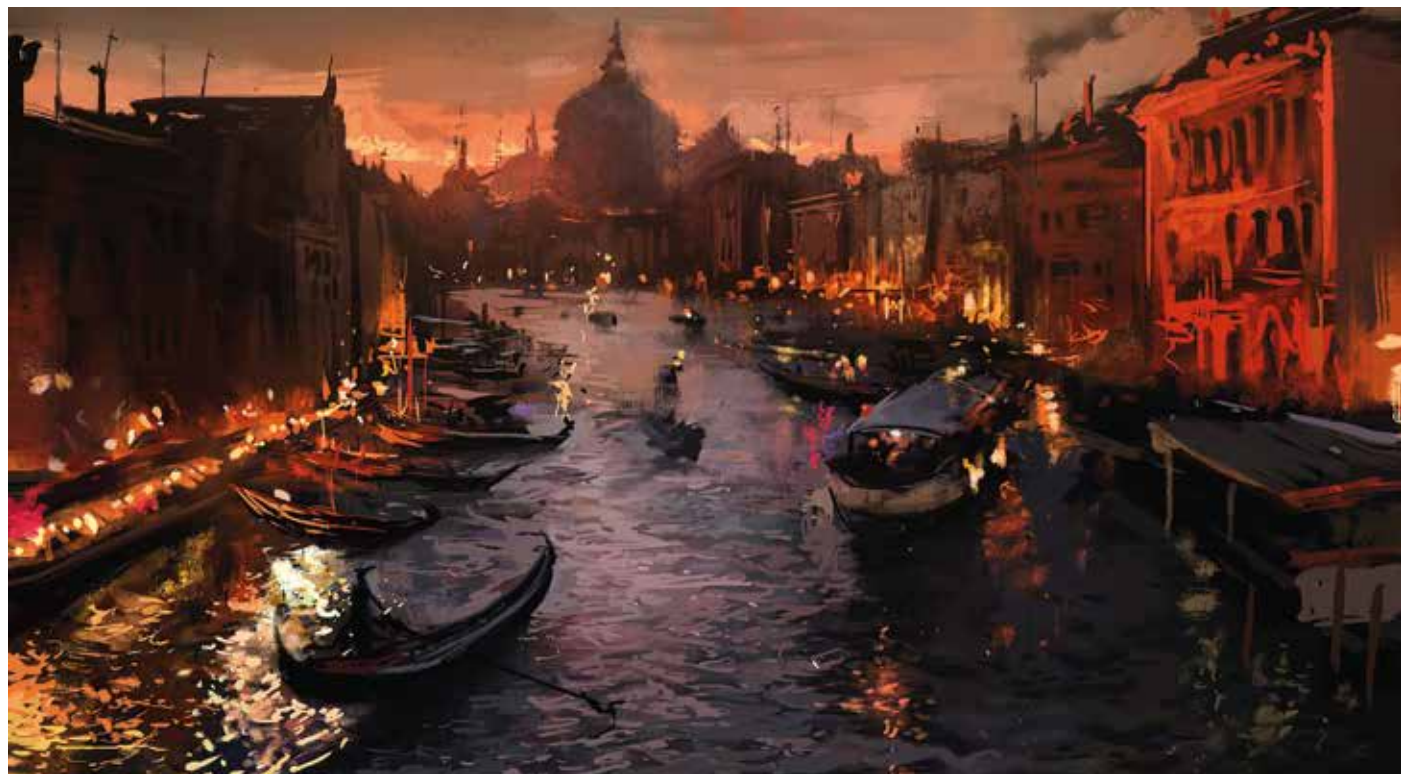
5 | Dusk River , 2015 | Adobe Photoshop, giclée print, 90x50 | signed I. D.: D. Zabrocki at lower right, endorsed on the reverse, limited edition of 20