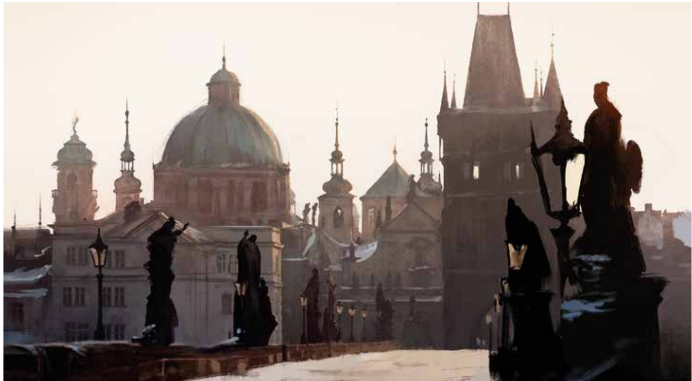
11 | Prague2 , 2014 | Adobe Photoshop, giclée print, 60x33 | signed I. D.: D. Zabrocki at lower right, endorsed on the reverse, limited edition of 20