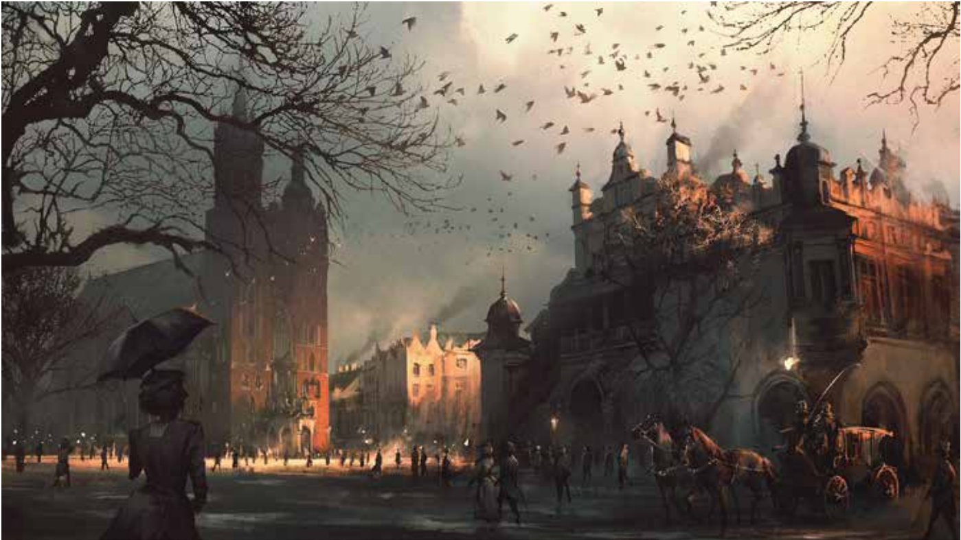
16 | The Market , 2015 | Adobe Photoshop, giclée print, 120x67 | signed I. D.: D. Zabrocki at lower right, endorsed on the reverse, limited edition of 20