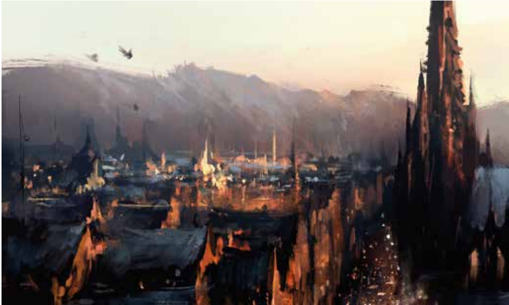
25 | Riot sketch3 , 2014 | Adobe Photoshop, giclée print, 40x21 | signed I. D.: D. Zabrocki at lower right, endorsed on the reverse, limited edition of 20