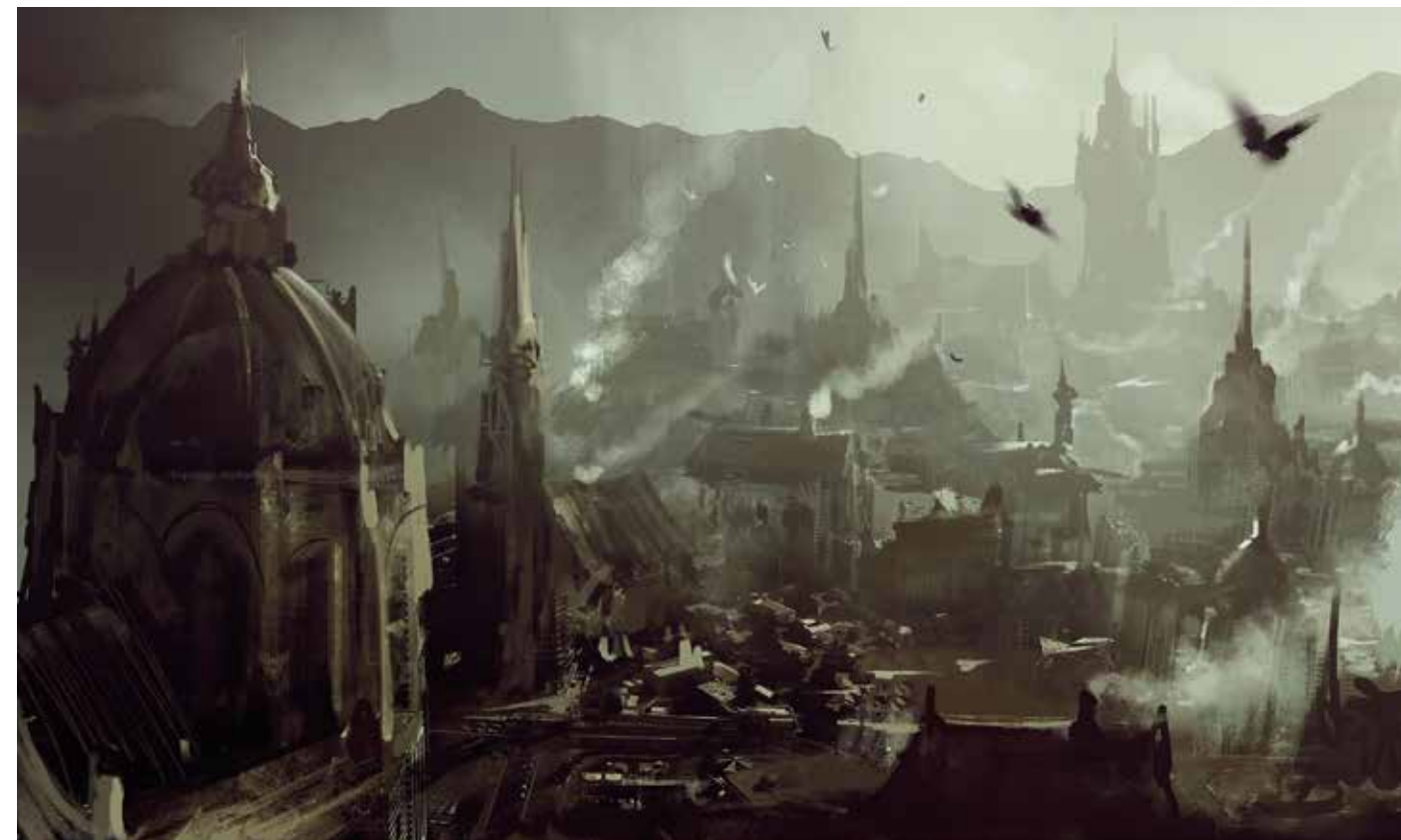
4 | Rpg Town , 2014 | Adobe Photoshop, giclée print, 100x60 | signed I. D.: D. Zabrocki at lower right, endorsed on the reverse, limited edition of 20