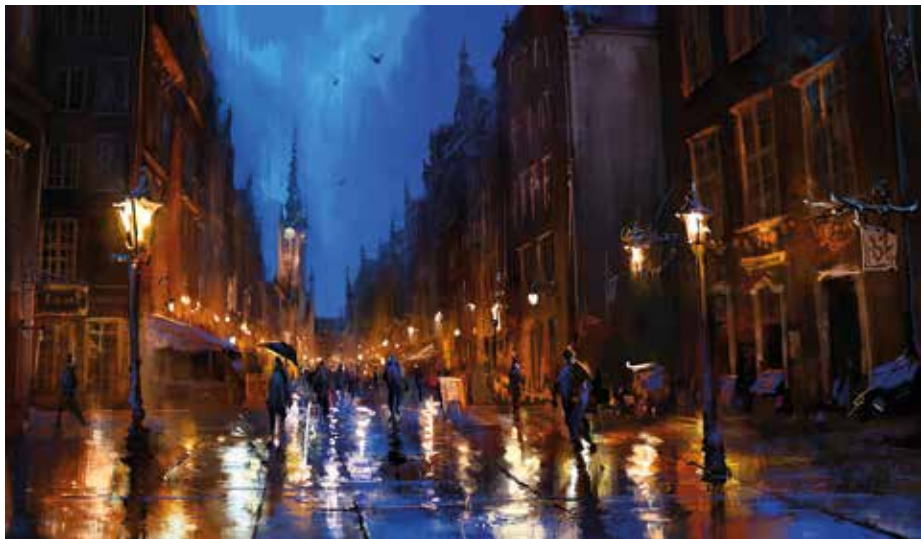
19 | Red lights , 2014 | Adobe Photoshop, giclée print, 100x70 | sygnowany I. D.: D. Zabrocki at lower right, endorsed on the reverse, limited edition of 20 20 | Walking on the Long street , 2015 | Adobe Photoshop, giclée print, 100x70 | sygnowany I. D.: D. Zabrocki at lower right, endorsed on the reverse, limited edition of 20