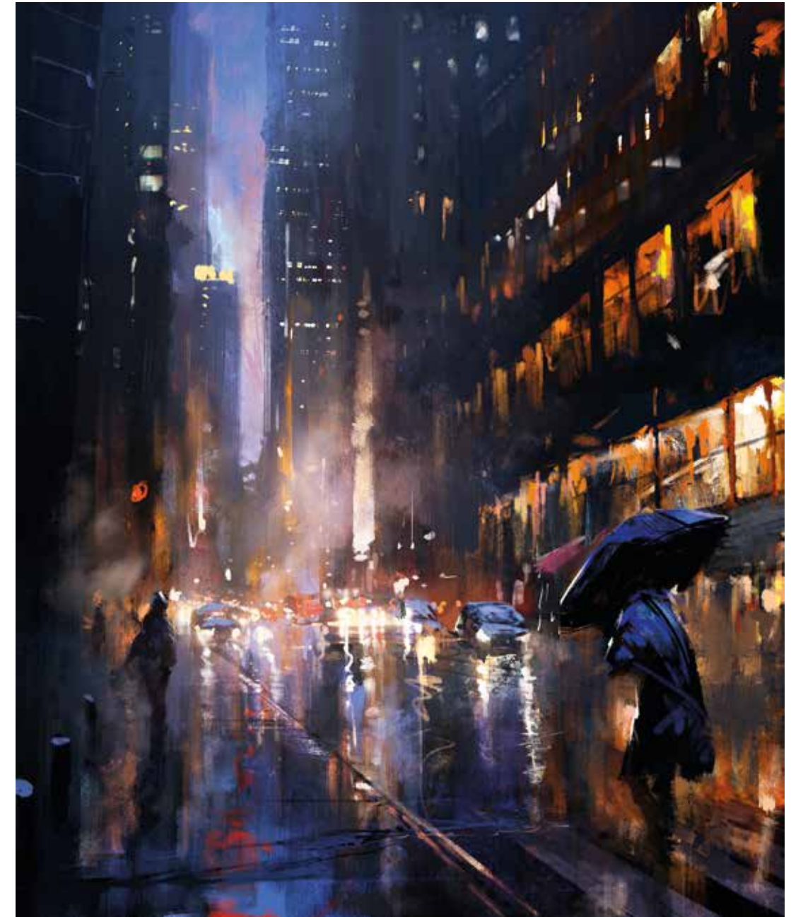
1 | In search of Sunrise, 2015 | Adobe Photoshop, giclée print, 84x100 | signed I. D.: D. Zabrocki at lower right, endorsed on the reverse, limited edition of 20