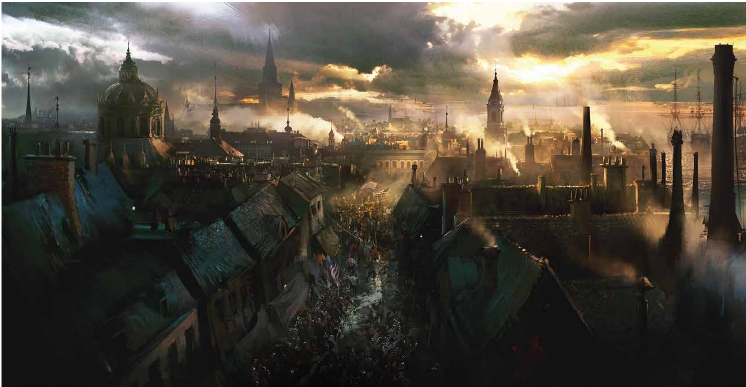
27 | Riot , 2014 | Adobe Photoshop, giclée print, 120x62 | sygnowany i. D.: D. Zabrocki at lower right, endorsed on the reverse, | limited edition of 20