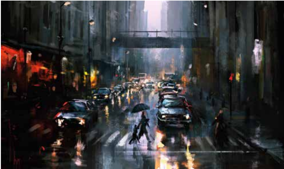
14 | Moon light , 2015 | Adobe Photoshop, giclée print, 90x56 | signed I. D.: D. Zabrocki at lower right, endorsed on the reverse, limited edition of 20