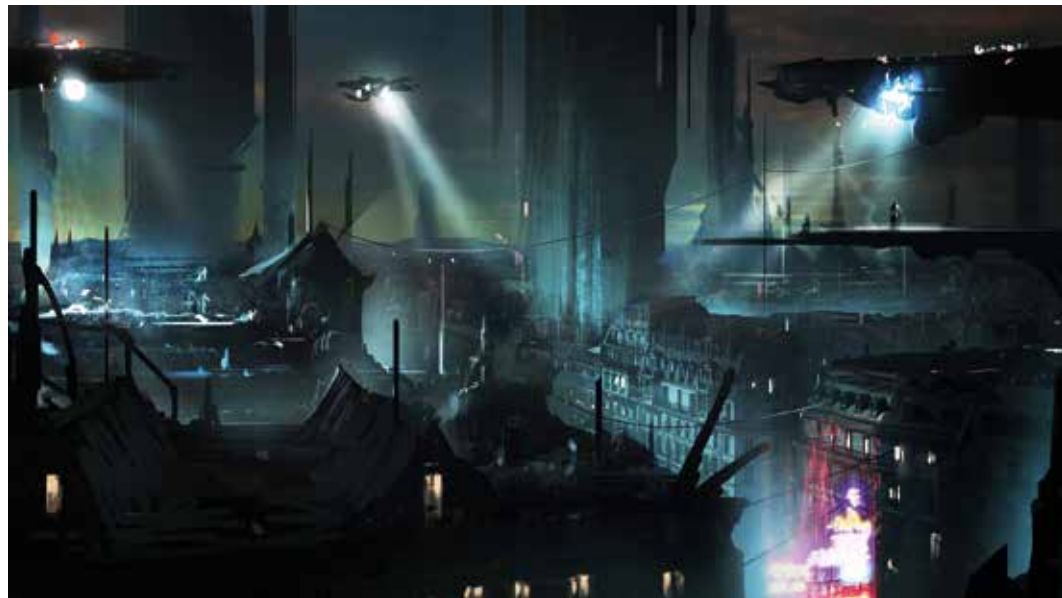
2 | Apocalypse , 2014 | Adobe Photoshop, giclée print, 100x54 | signed I. D.: D. Zabrocki at lower right, endorsed on the reverse, limited edition of 20